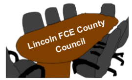
FCE Council Meeting March 14, 2017