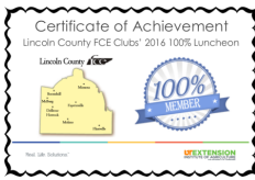
FCE 100% Luncheon April 22, 2017